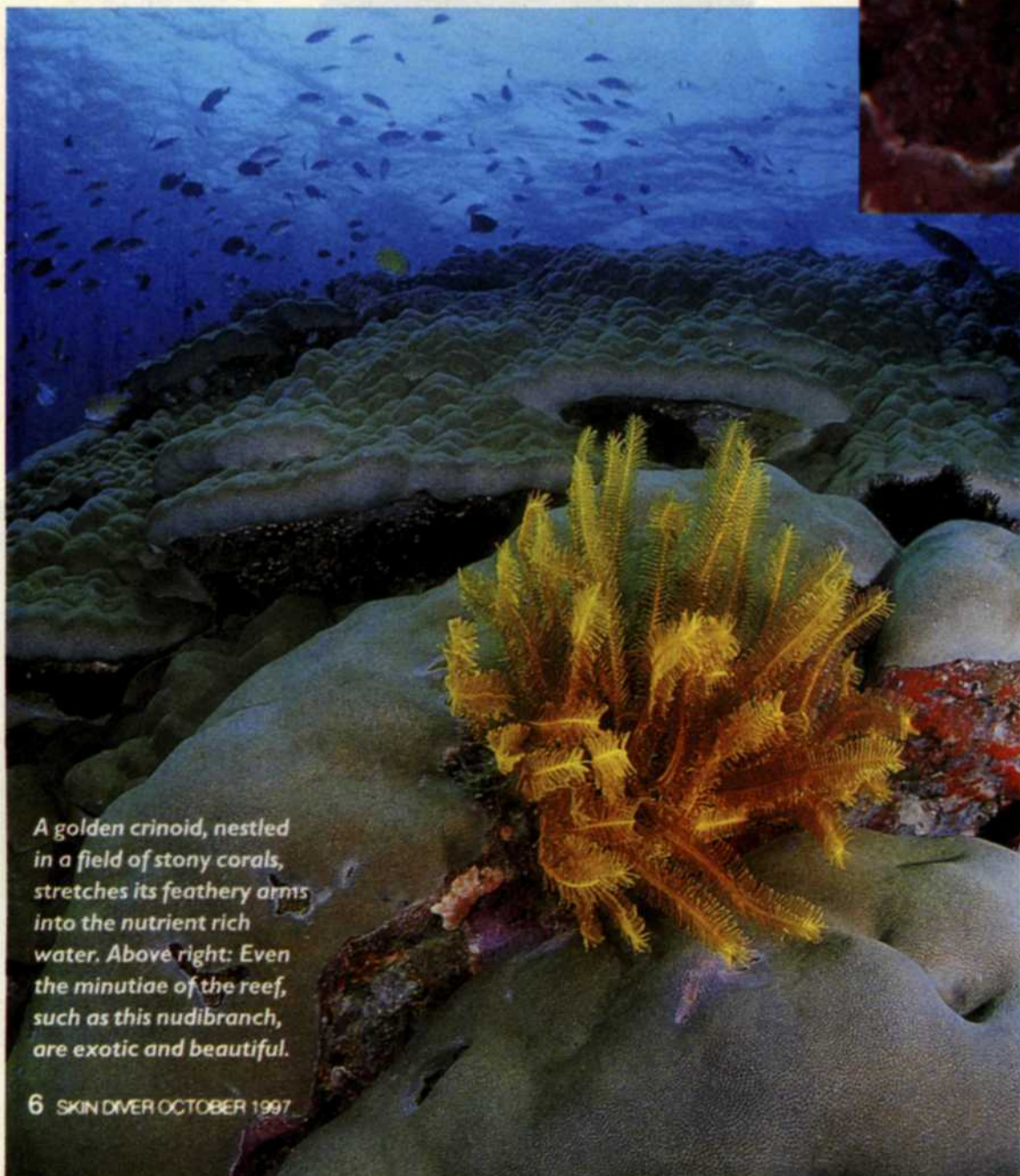
A golden crinoid, nestled in a field of stony corals, stretches its feathery arms into the nutrient rich water. Above right: Even the minutiae of the reef, such as this nudibranch, are exotic and beautiful.

TEXT AND PHOTOGRAPHY BY JACK AND SUE DRAFAHL