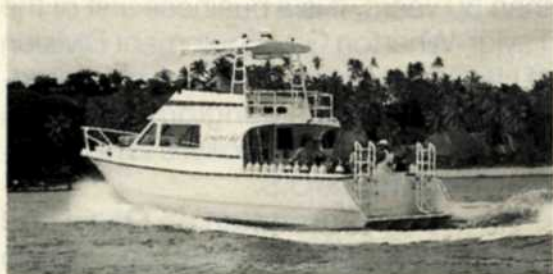
Above: L'Aventure, the resort's speedy and roomy 37 foot dive boat. Below: Jean-Michel Cousteau is the developer of this slice of paradise on Vanua Levu Island.

Canyons is typical of one of these dives and has fields of hard corals forming swim-throughs for both sharks and divers. Jackson's is loaded with gigantic seafans down to 90 feet, with soft coral gardens at the 40 to 60 foot level. One of our favorites is Hole in the Wall . The dive begins with an impressive swim along a